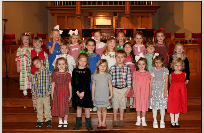
K-1 st grade choir