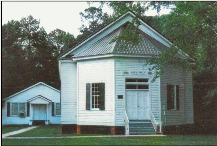
Union Church Presbyterian Church (Present building built in 1854)

PART TWO (an update from the February 2011 article) More information has come to light on one of the oldest churches in the Old Southwest.