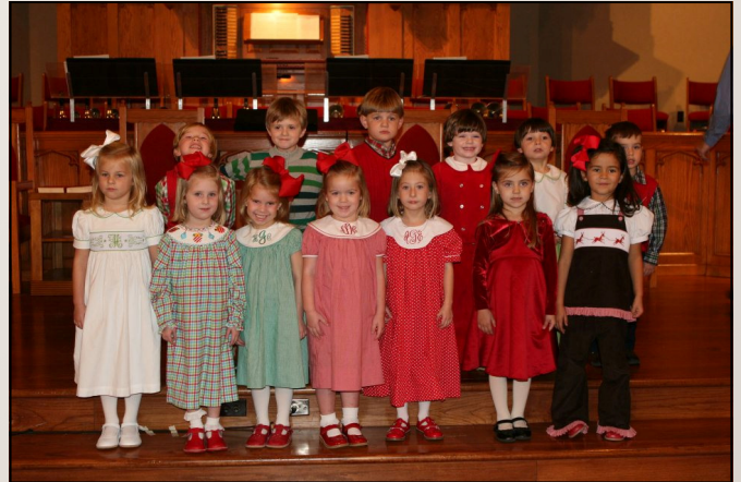
4 year old choir

Let us not become weary in doing good, for at the proper time we will reap a harvest if we do not give up. Galatians 6:9 (NIV)