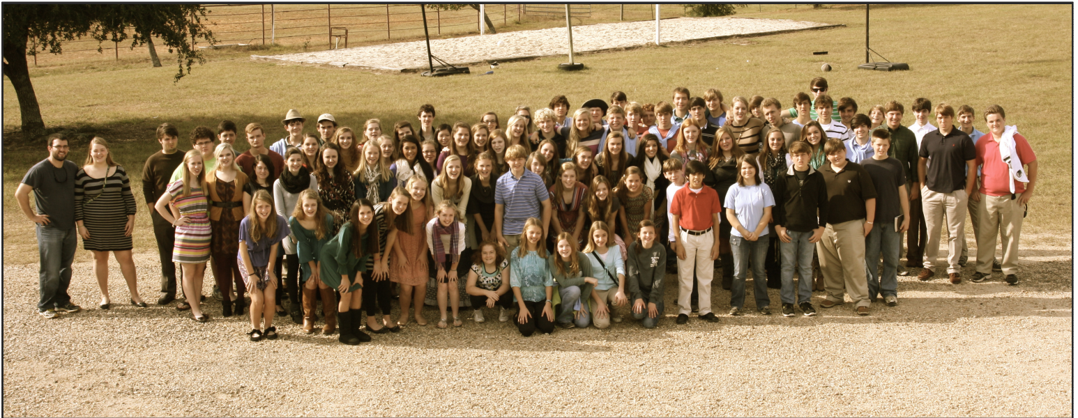
2012 Youth White Horse Retreat