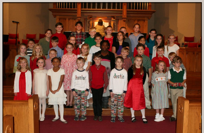
2 nd -6 th grade choir