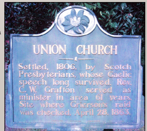
Historical Marker Located in front of Union Church Presbyterian Church