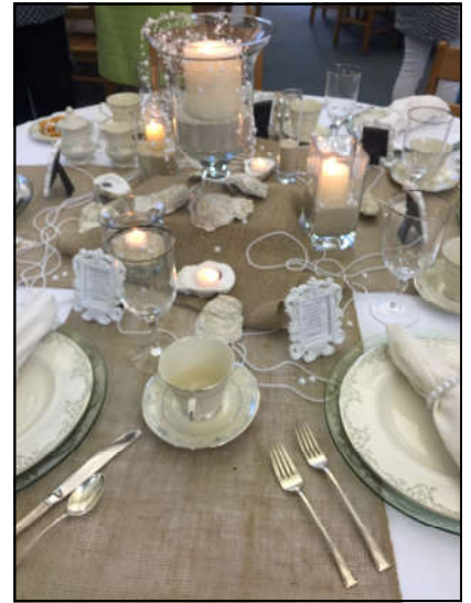
2016 FPC Women's Ministry Scripture Dinner

The Women's Ministry Council, which leads the Women's Ministry, meets monthly to plan, organize and implement the many ways the women support the life of the church. From planning funeral meals and receptions to supporting local missions (Palmer Home for Children and Reformed University Fellowship at USM, for example), the Women's Ministry is a vibrant part of FPC.