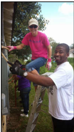
Painting a house in east Hattiesburg

Hope for Hattiesburg began in 2006 as a partnership with Ebenezer Missionary Baptist to help restore homes after Hurricane Katrina. Since that time, approximately 45 homes have been repaired. Our mission is twofold. First, we purpose to assist needy families by doing deeds of justice and mercy. Second, we want to show forth the power of the gospel to transform historically challenging racial relationships.