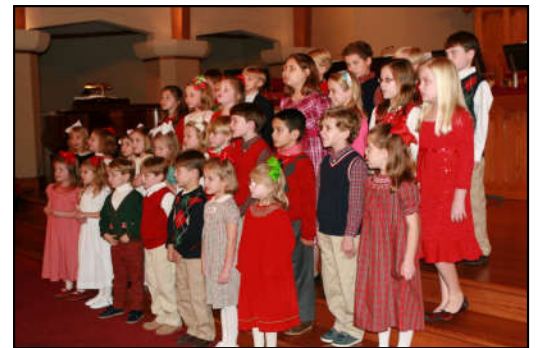
FPC Children's Choir