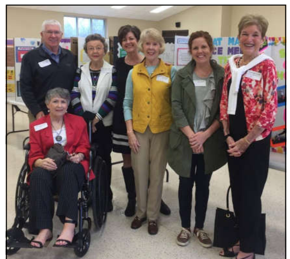
FPC members judging Science Fair at Grace Christian

More information about this ministry can be found at HopeforHattiesburg.org .