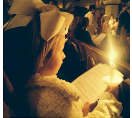
2016 FPC White Gift Candlelight Service