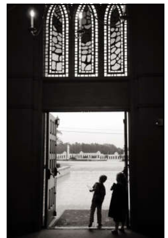
FPC children handing out bulletins before the worship service

Children ages two to sixth grade have the opportunity to participate in the children’s choir and catechism classes on Wednesday evenings after church-wide supper.